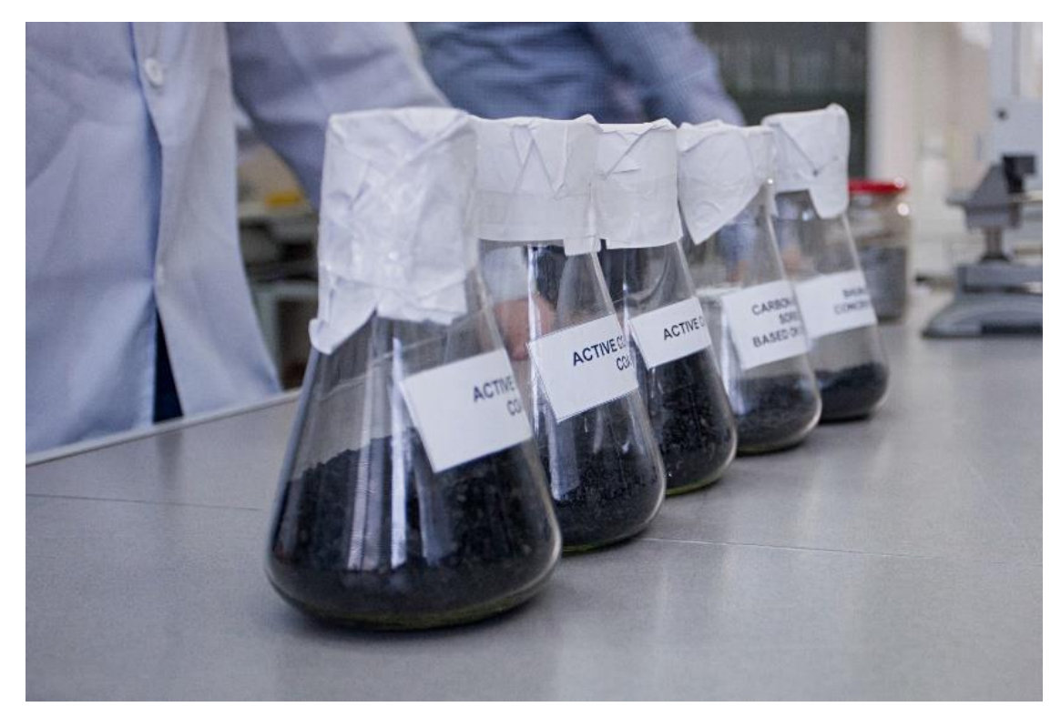
Figure 3 – Activated carbon samples