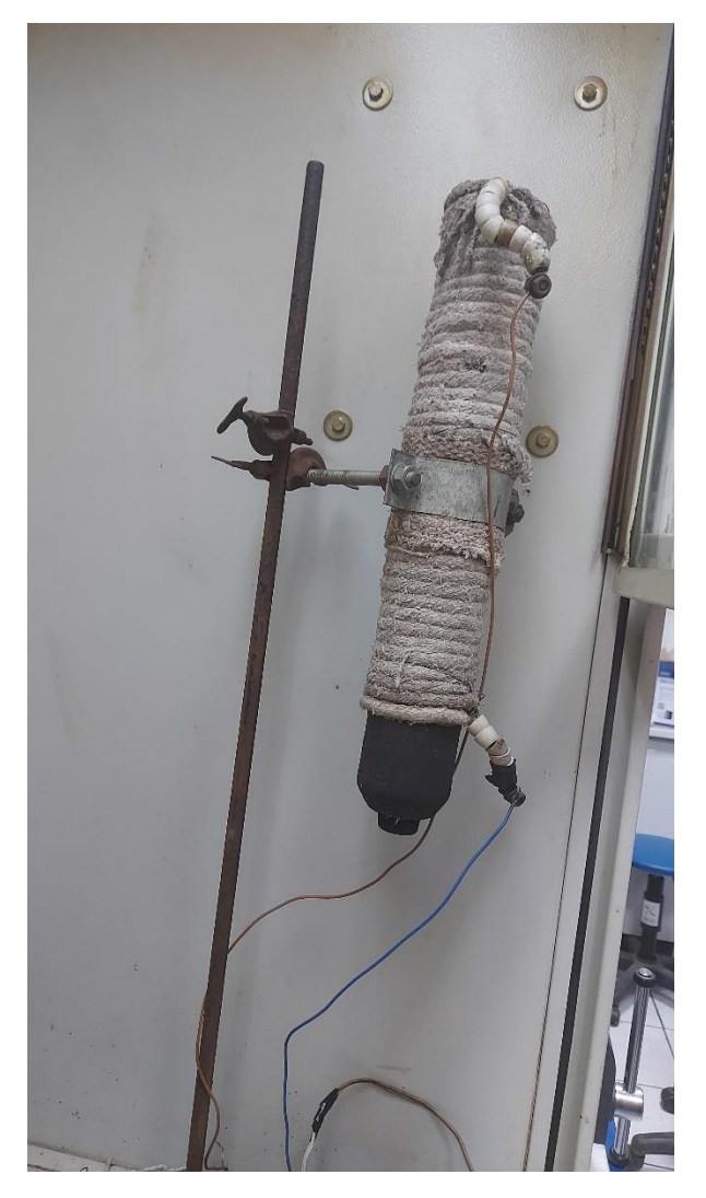
Figure 2 - Installation for activation by superheated steam