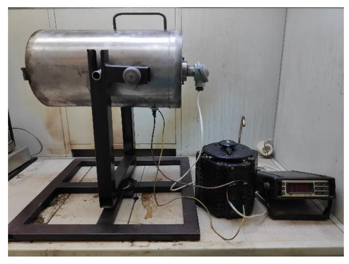
Figure 1 – Installation for the carbonization of vegetable raw materials in an inert atmosphere